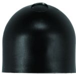
6LV1352 Light Shield Accessory for EK4036S, EK4436SM, K4000 Series Button Photocontrols