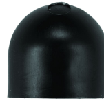
6LV1352 Light Shield Accessory for EK4036S, EK4436SM, K4000 Series Button Photocontrols