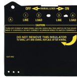
124T1952 Insulator for Double-Pole Time Switch (T103, T104, T105, T173, T174, T175, T176, T185, WH40)