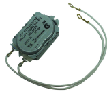
WG1573-10DMX 208-277 VAC, 60 Hz Motor for T102, T104, T106, T172, T174, WH40