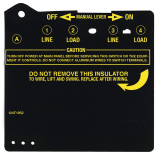
124T1952 Insulator for Double-Pole Time Switch (T103, T104, T105, T173, T174, T175, T176, T185, WH40)