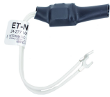
ET-NF RC Snubber Noise Filter 24-277VAC/DC for Electronic Controls