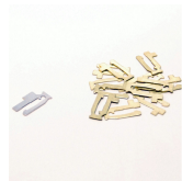
156T1950A Set of 12 Trippers for T1900, T2000, C8800, R8800 and T8800 Series