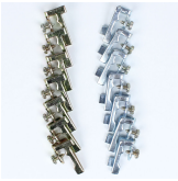
156T2548A 7 Sets of ON/OFF Trippers for T7400 and T7800 Series