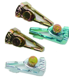
156T1978AMX 1 Set of ON/OFF Trippers for T100, T7000, and WH40