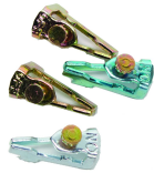
156T1978A Extra/replacement trippers 1 ON and 1 OFF