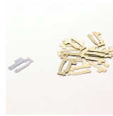
156T1950A Set of 12 Trippers for T1900, T2000, C8800, R8800 and T8800 Series