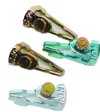
156T1978AD12 12 Pack of 156T1978A Trippers for T100, T7000, and WH40