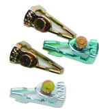
156T1978A Extra/replacement trippers 1 ON and 1 OFF