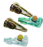
156T1978AD12 12 Pack of 156T1978A Trippers for T100, T7000, and WH40