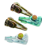
156T1978A Extra/replacement trippers 1 ON and 1 OFF