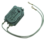
WG1573-10DMX 208-277 VAC, 60 Hz Motor for T102, T104, T106, T172, T174, WH40