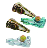
156T1978AD12 12 Pack of 156T1978A Trippers for T100, T7000, and WH40